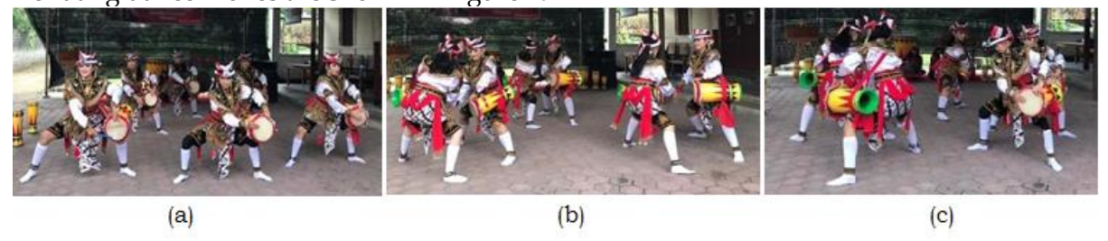
Figure 1. (a) Sundangan motion; (b) lilingan motion; (c) Gejoh Bumi motion (L. N. Azizah et al., 2021)

The number of dancers in the Reog Kendang dance is six people. The six dancers perform movements in the form of configurations or floor movements. A mutually agreed choreographer develops free floor motions. However, you must still pay attention to the types of standard dance movements by relying on head and foot movements. The types of movements in the Reog Kendang dance are motions of baris, sundangan, andul, menthokan, gejoh bumi, ngongak sumur, midak kecik, lilingan, and sundang. Some of the Reog Kendang dance moves are shown in Figure 1.