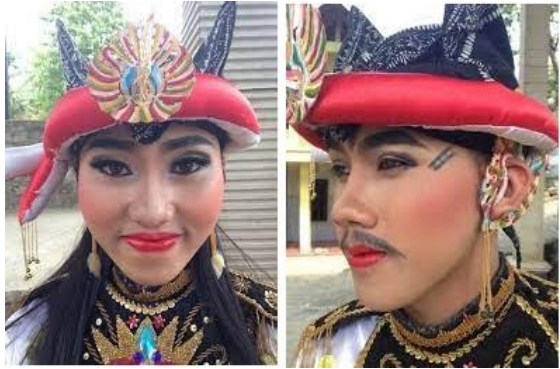
Figure 3. Reog Kendang Dancer Makeup (Lestari, 2014)

The makeup of the Dancer Reog Kendang depicts the character of a soldier who is stubborn, dashing, brave, and elegant in carrying out his duties. Reog Kendang's makeup includes red and brown eyeshadow, black eyelids, chili red lipstick, and black eyebrows to give a scary but beautiful impression. The makeup of the Reog Kendang dancer is shown in Figure 3.