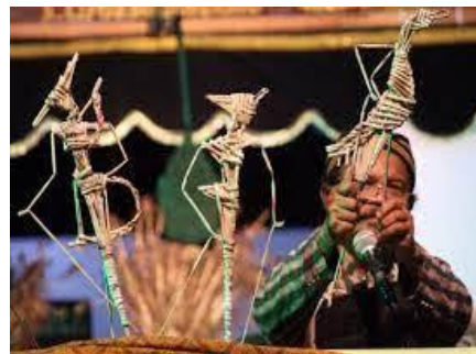
Picture 3. Wayang Jemblung