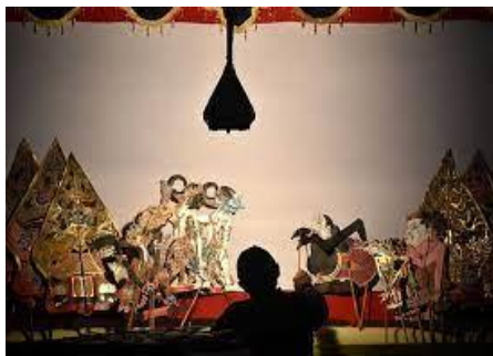
Picture 2. Wayang Kulit