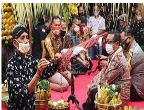
Picture 1. Jamasan Heirloom Tradition in Tulungagung