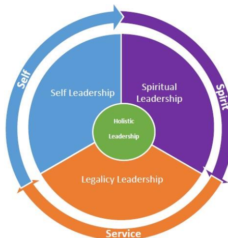
Gambar 1. Cycle of Holistic Leadership , Satinder Dhiman (2016)

According to Dhiman (2017) the understanding of the word "holistic" in the context of leadership is on an overall or "integrated" scale. This means that holistic leadership is leadership carried out by a leader who is committed to the development of the physical, mental, emotional, moral and spiritual dimensions in harmony. Holistic leaders, they always look within themselves, transform themselves and engage themselves for the common good. They have a deep understanding of the human system. They learn to master the language of transformation and help ordinary people achieve extraordinary things. The bottom line is that holistic leaders have their own direction and other focus. The holistic leadership approach is truly self-exploring, and culminates in the appreciation of our deepest values at the personal, team and organizational levels. The key to holistic leadership is the integration of self-motivation and the leader's contribution. A holistic understanding of leadership is characterized by "Three S; Self, Spirit and Service". Each represents three overarching dimensions of holistic leadership; Self Leadership, Authentic Leadership and Legacy Leadership. Each leadership competency displays two sides, namely from the perspective of the leader and the perspective of the led. The following is a picture of a holistic leadership cycle and framework.: