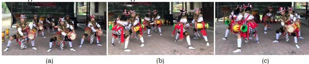
Figure 1. (a) Sundangan motion; (b) lilingan motion; (c) Gejoh Bumi motion (L. N. Azizah et al., 2021)

The number of dancers in the Reog Kendang dance is six people. The six dancers perform movements in the form of configurations or floor movements. A mutually agreed choreographer develops free floor motions. However, you must still pay attention to the types of standard dance movements by relying on head and foot movements. The types of movements in the Reog Kendang dance are motions of baris, sundangan, andul, menthokan, gejoh bumi, ngongak sumur, midak kecik, lilingan, and sundang. Some of the Reog Kendang dance moves are shown in Figure 1.