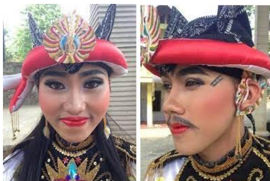
Figure 3. Reog Kendang Dancer Makeup (Lestari, 2014)

The makeup of the Dancer Reog Kendang depicts the character of a soldier who is stubborn, dashing, brave, and elegant in carrying out his duties. Reog Kendang's makeup includes red and brown eyeshadow, black eyelids, chili red lipstick, and black eyebrows to give a scary but beautiful impression. The makeup of the Reog Kendang dancer is shown in Figure 3.