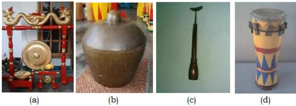
Gambar 4. (a) gong; (b) kenong; (c) slomporet; (d) drum (Hayuhantika & Rahayu, 2019)

The ethnomathematics elements in the Reog Kendang dance are shown in Table 3. It shows the potential for the field of ethnomathematics studies. The musical instruments have a variety of shapes consisting of a combination of flat build and space building.