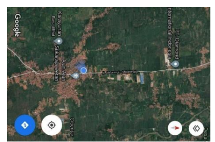
Figure 1. Map of research location in Sukaraja village, Majalengka

residents and the building of houses in the village of Sukaraja. Sukaraja village is located on the main route of Majalengka Jatiwangi, where Sukaraja village has many rice fields and factories which are the livelihoods of the people of Sukaraja and its surroundings.