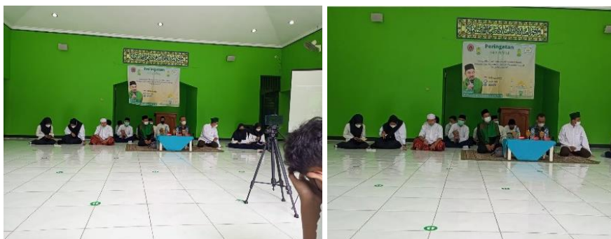
Picture 2 Activity of Isra' Mi'raj

While activities that implement a full online activity strategy, for example, are PHBI activities, one of which is Isra' Mi'raj where all participants (class 10, 11 and 12 students) take part online through Google Meetings and only the committee comes directly to the school mosque. To prepare for the live recitation, apart from the Rohis committee, the principal and the spiritual coach were also present in person at the school. the activity began with remarks from the principal, builder and head of the spirit, followed by the reading of verses from the Qur'an by one of the members of the new spirit, after which entered the main event, namely a lecture filled by the builder of the Rohis himself, attendance for this activity was taken through filling out the Google Form attendance list. . from the observations of researchers when participating in Isra' Mi'raj activities online, the main obstacle felt was the school network which sometimes broke up so that the delivery of material was disrupted.