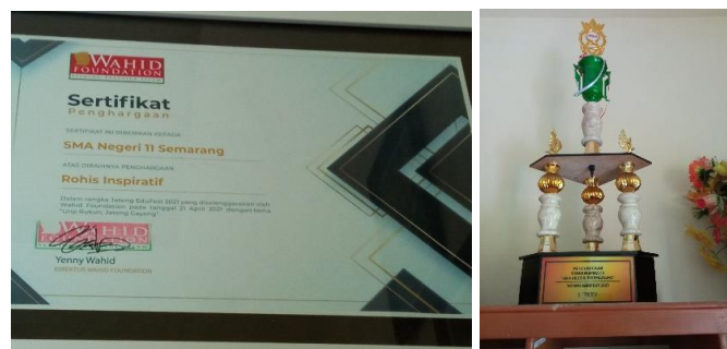
Picture 3 Achievement of Rohis

At this event, the Spirit of SMA Negeri 11 Semarang received an award as an Inspirational Spirit for his efforts to inspire the realization of tolerance in schools.