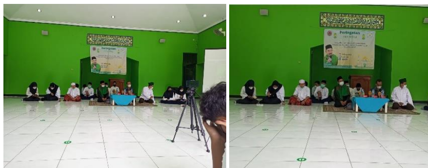
Picture 2 Activity of Isra' Mi'raj

While activities that implement a full online activity strategy, for example, are PHBI activities, one of which is Isra' Mi'raj where all participants (class 10, 11 and 12 students) take part online through Google Meetings and only the committee comes directly to the school mosque. To prepare for the live recitation, apart from the Rohis committee, the principal and the spiritual coach were also present in person at the school. the activity began with remarks from the principal, builder and head of the spirit, followed by the reading of verses from the Qur'an by one of the members of the new spirit, after which entered the main event, namely a lecture filled by the builder of the Rohis himself, attendance for this activity was taken through filling out the Google Form attendance list. . from the observations of researchers when participating in Isra' Mi'raj activities online, the main obstacle felt was the school network which sometimes broke up so that the delivery of material was disrupted.