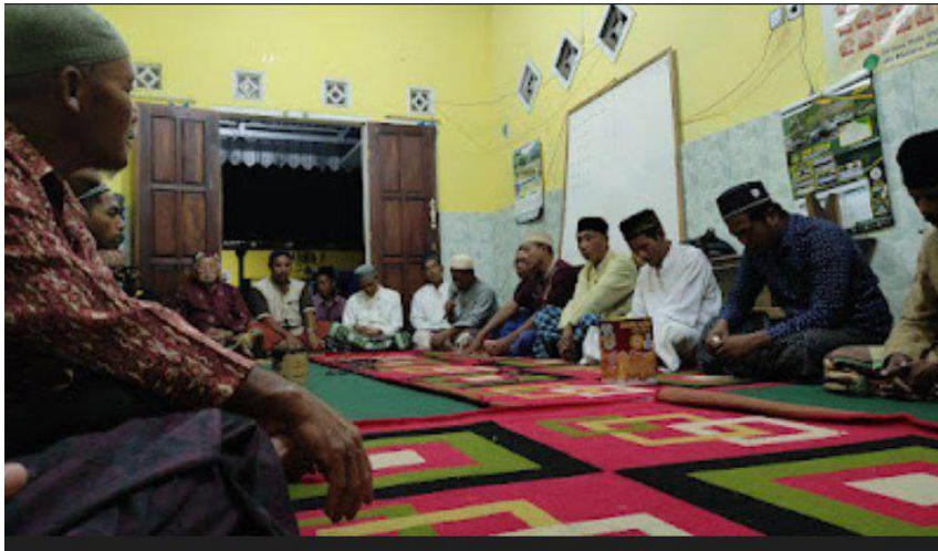
Figure 2. Routine Recitation

The contribution made by this Muslimin-Muslimat activity to the prevention of radicalism in Indonesia is as a forum for people from all groups to understand their religion which shows that the religion they hold is a religion that is far from extremism and also adheres to tasamuh or religious moderation. So that with this activity it becomes a fortress for the community so that it is not easily influenced by the extremism movement which is currently easy to develop, especially for young people and parents who are targeted to carry out this extremism. According to the head of the RT, this explains that in Bululawang Village, even though the majority are Muslims, there are also non-Muslims and it is also not feasible to get to know them outside Bululawang Village or to follow online programs that are private (therefore, in Bululawang Village it is not surprising that all RT and RW have routine activities that are required for Muslims and Muslim women to participate from the beginning to the end so that, with this activity, it will be able to prevent the community from deviant influences and mislead the local community such as rejecting religious tolerance or what is known as extremism or radicalism.