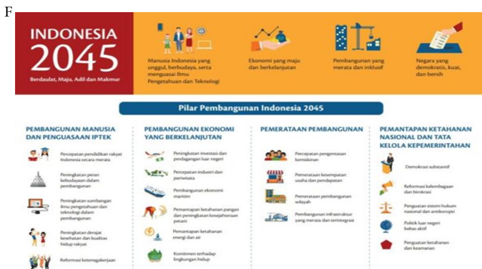
Figure 1. Taken from the Advanced Indonesia Development 2045 website

Preparing for the 2045 generation as the golden generation, the government and education implementers will continue to make the education process for all the main road and homework that must be completed. Not only equity, but also quality improvement. Starting from the early childhood education movement, completing and improving the quality of basic education, preparing for universal secondary education (PMU), and expanding access to tertiary institutions are also being prepared through the establishment of state universities and granting special access for people who have limited economic capacity but are academics are able to obtain educational services at a higher level of education.